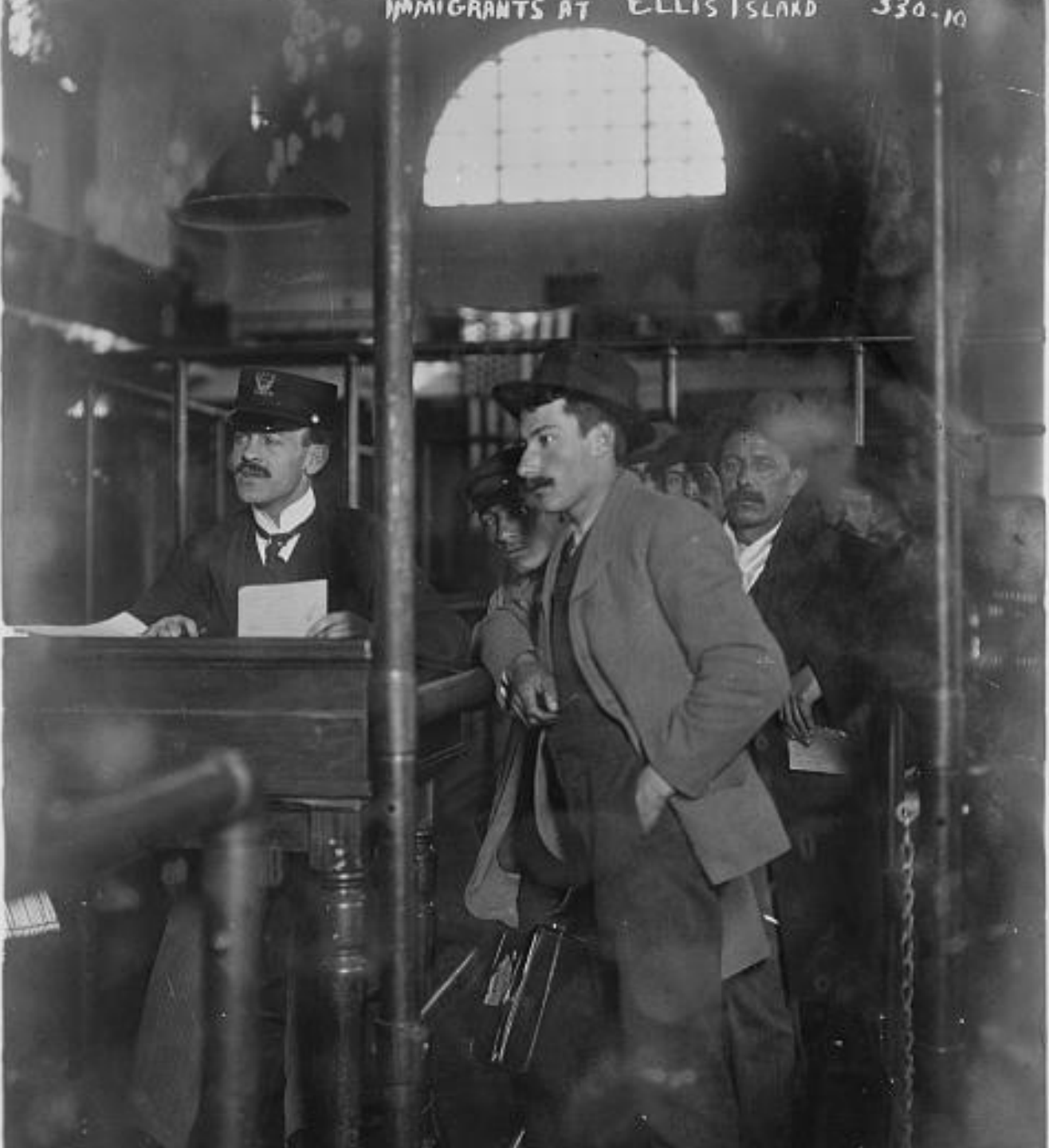
IMMIGRANTS AT ELLIS ISLAND 330-10